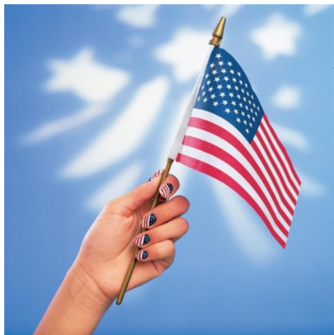
Fourth of July